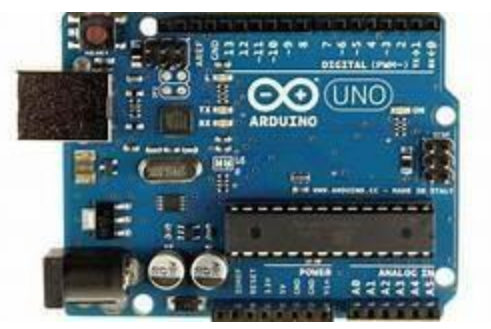
Figure 4 shows the Arduino microcontroller where the Arduino board can communicate at various baud rates. Baud measures how many times the hardware can send 0's and 1's in a second. The software used by the Arduino is Arduino IDE.

and programmable input/output devices. The primary application for microcontrollers is embedded systems, including the engine control systems of automobiles, compatible medical devices, remote controls, office machinery, and other embedded systems such as selfregulating products and gadgets.