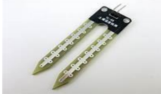
Figure 5: Soil Moisture Sensor

The soil moisture sensor depicted in figure 5 contains two probes via which current flows into the soil and then detects the soil resistance to read the moisture level. The water soils are more prone to electrical conductivity, resulting in reduced resistance in the soil; on the other hand, dry soils have higher resistance to electrical conductivity.